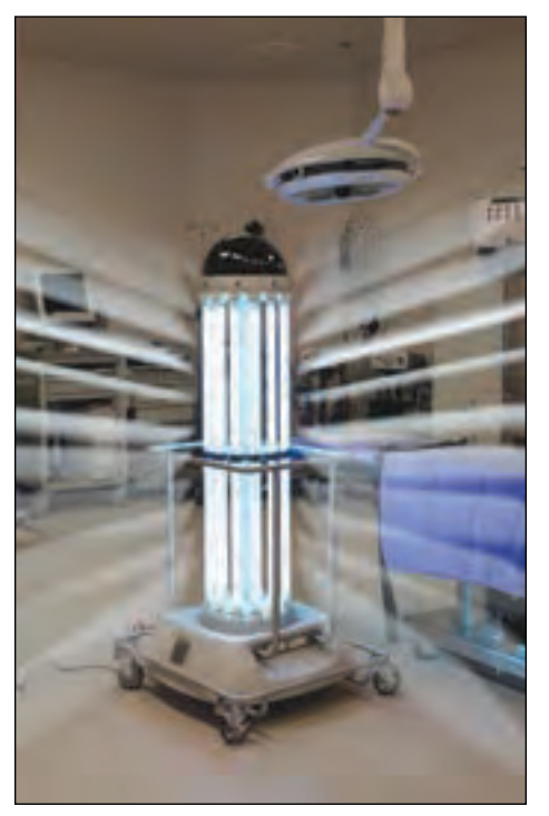
Tru-D Rapid Room Disinfection device

Last year, PCH put into service all new Stryker hospital beds. These beds have many innovative features, including multi-position support siderails to reduce injuries to patients and to caregivers, and a state-of-the-art bed alarm system designed to alert caregivers when an at-risk patient attempts to exit the bed. The recent purchase of Broda chairs also helped to keep patients safe while seated without the use of restraints.