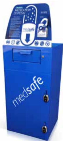
Sharps Compliance, Inc.

When opting for automatic liner delivery, be sure to schedule a liner replacement frequency that will meet demand to avoid purchasing expensive unscheduled liner replacements. If a liner fills more quickly than anticipated and an off-schedule liner is needed, order it as soon as possible. Locking and suspending use of a full receptacle can result in customers discarding medications for disposal on/around the receptacle.