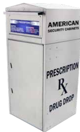
American Security Cabinets, Inc.

Not necessarily to scale. Receptacle models shown are not being endorsed. Some models not shown.