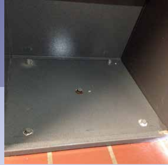
Receptacle affixed to floor